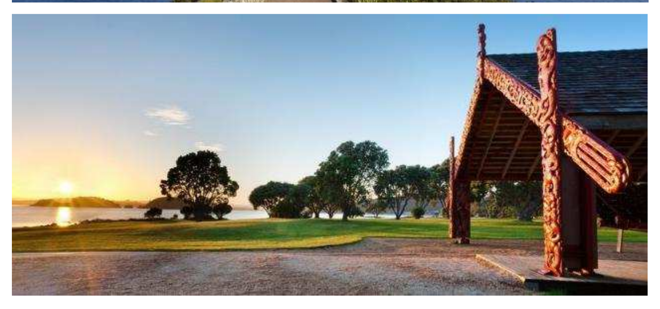
Pictured: Cape Brett, Cape Reinga Lighthouse and Waitangi Treaty Grounds