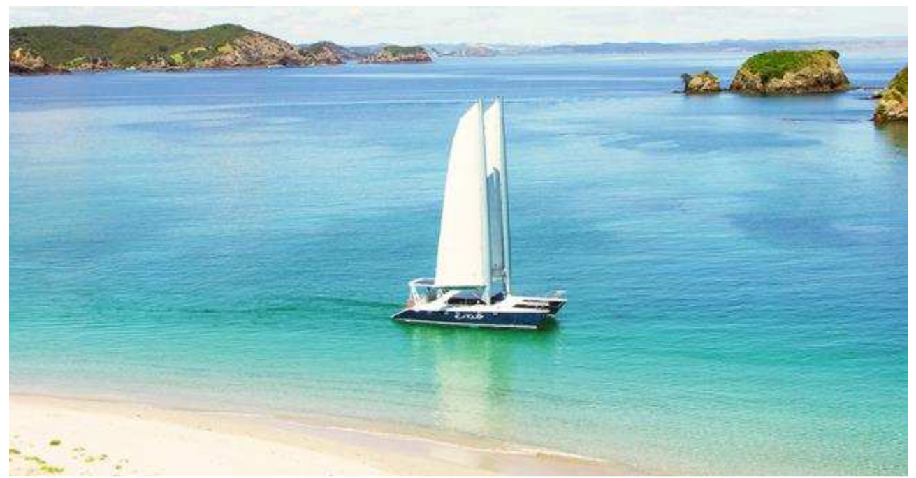
Or if you prefer a day's fishing and cruising in the Bay of Islands, then we can arrange the following day trip at no extra cost:

On boarding the 40ft 'Screaming Reels' boat, you will experience a warm and comfortable boat combining the extreme fishing capabilities of an epic fishing vessel, with the best sea keeping abilities of its size for cruising. This premier game boat has the perfect blend of comforts for cruising and its fishing ability. It's equipped with the latest fishing gear and the best crew in the Bay, ensuring the best day out.